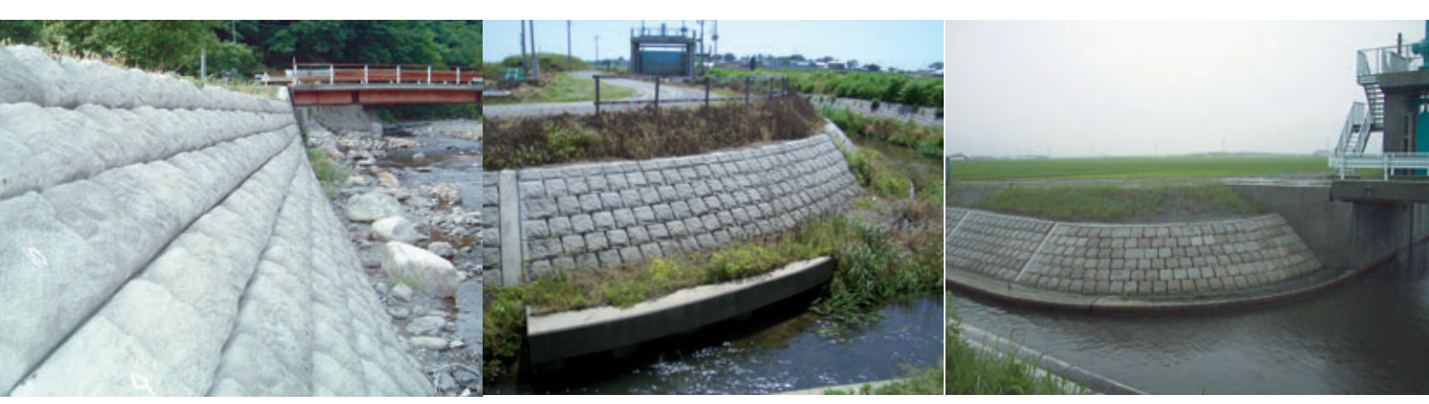
Examples of application