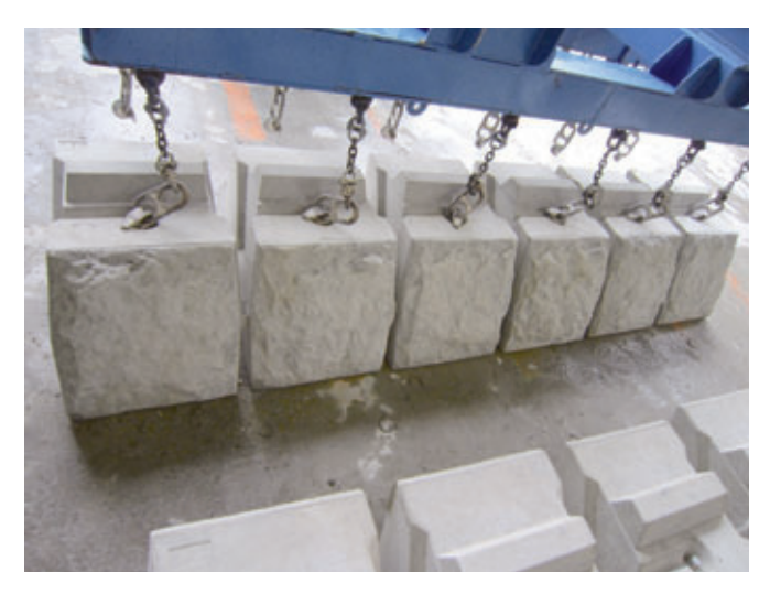
"Furusato" - blocks can be adapted to individual situations by freely adjusting its radius.

Rivers in Japan are characterized by considerably steep gradients and flows. In addition, due to recent climate change, flooding and torrential downpours occur frequently. They highly evolved the blocks used for revetment and various functions are developed and added to these blocks. In this issue, "Furusato", which have advantages of both construction efficiency and environmental function, will be introduced.