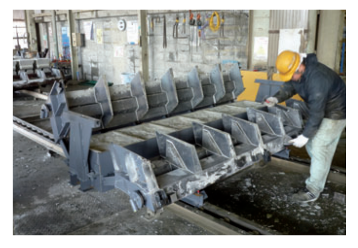
The moulds made by Toyota Forms can be operated easily by one person.

This Block system has a structural stability against earth pressure by 1) having enough unit weight for each product, and 2) connecting with shearing joint by male and female, laying the 6 pieces- linked blocks in a zigzag pattern. Having flexibility means even if the product connection and positioning is not so exactly, the blocks can be fit and constructed with no problem.