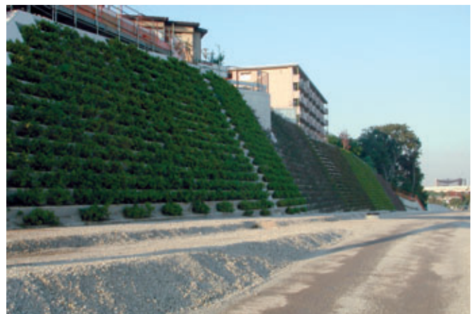
The Green-Retaining wall is green landscape concrete block ...