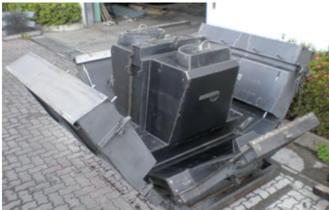
Mold for Green-Retaining wall elements

As a hollow concrete block, Green-Retaining wall is not only well drained after heavy