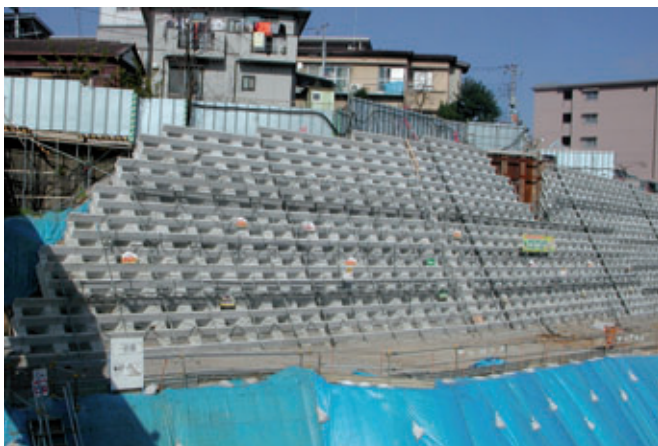
Green-Retaining wall under construction