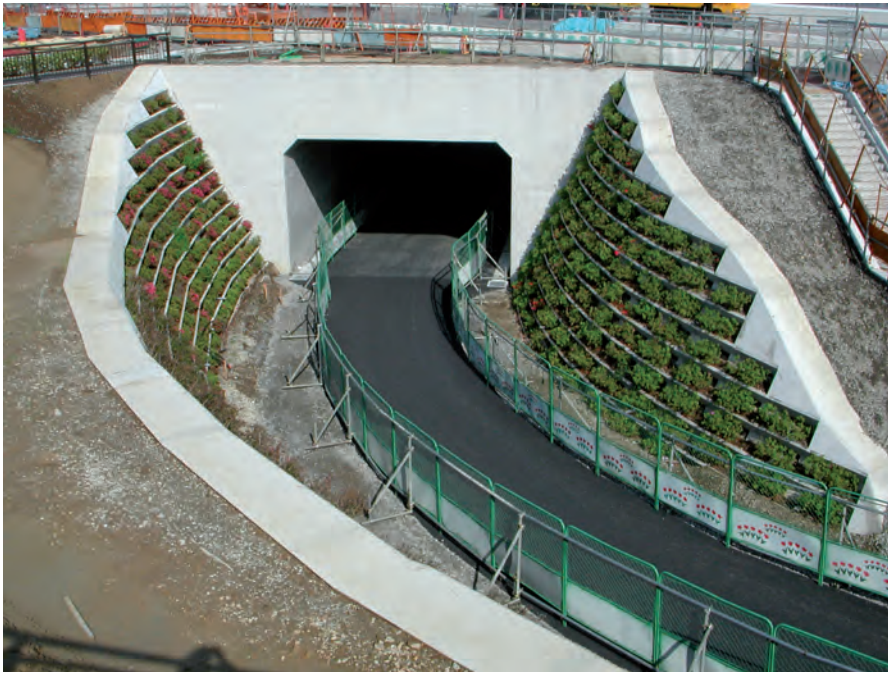
... that is widely used in road side, river side, housing land development areas

rainfall, but also has the ability of water retention. That is, this product does not require irrigation or watering plants even in drought conditions.