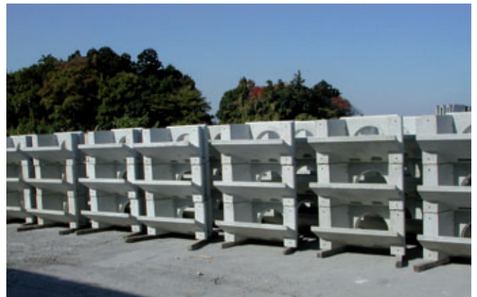
Green-Retaining elements at the stockyard